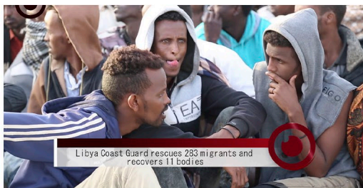
Libya Coast Guard rescues 283 migrants and recovers 11 bodies

The Company is requiring the passengers departing from Mitiga airport, copies of the passports and visas, in addition to a Coronavirus vaccination certificate recognized by the European Medical Agency (EMA), 48 hours before the departure time.