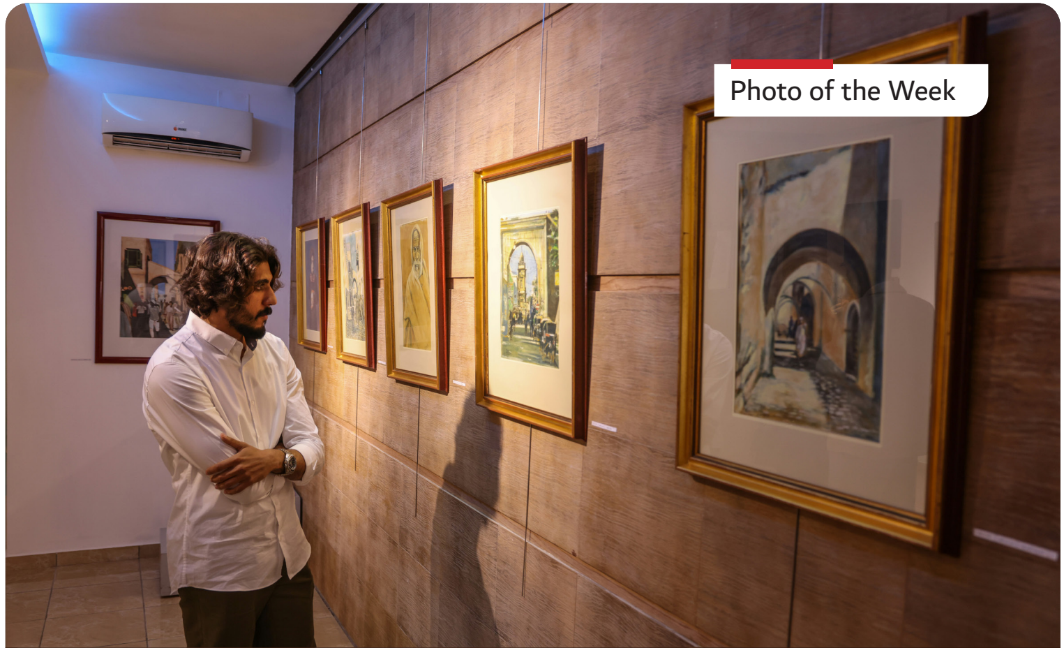
Photo of the Week