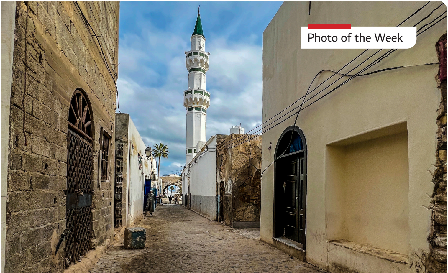
Photo of the Week